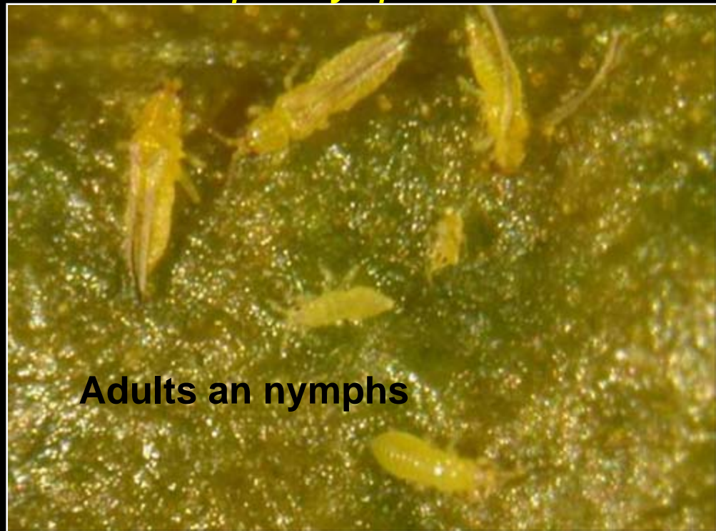
Adults an nymphs