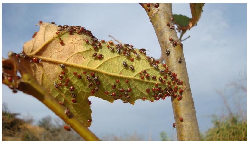
Fig. 4. Multiple life stages of the Bagrada bug aggregate on many plants, including non-hosts, in the fall when pest populations are high and food is scarce.