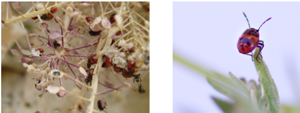
Fig. 3. Early instar nymphs of Bagrada bug on dried alyssum (left). Note in the close up photo (right) that the nymph resembles an adult ladybird beetle, with similar bright coloration.