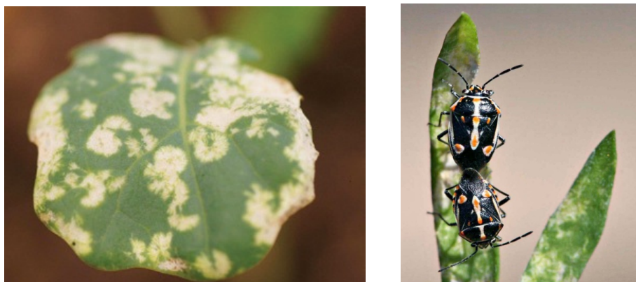
Fig. 5. Typical fresh feeding damage appears light green with starburst lesions and then bleaches with age, giving leaves a “scorched” appearance when feeding is heavy (left). Multiple stages of Bagrada bug adults and nymphs (not shown) have caused large white stippled areas on alyssum (right).

Adults and nymphs of the Bagrada bug feed on leaves, stems, flowers and seeds. They insert their needle-like mouth parts into young leaves, inject digestive enzymes and suck the juices, which results in starburst-shaped lesions (fig. 5). Leaves eventually have large stippled areas and may wilt and die. Ultimately damage results in “scorched” leaves, stunting, blind terminals, and forked or multiple heads on cauliflower, broccoli and cabbage. Bagrada bugs are particularly damaging to small plants and may kill seedlings.