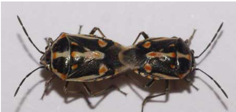
Fig. 1. Adult Bagrada bugs are black with orange and white markings and are commonly found mating, positioned end-to-end. Note that the female (left) is longer than the male (right).

Adults are black with orange and white markings; the shield-shaped body is about ¼-inch (5-7 mm) long and about half as wide at the broadest part (fig. 1). Eggs are barrel shaped and initially white but eventually turn orange (fig. 2). Females lay eggs in the soil beneath host plants, but may also oviposit on leaves or on hairy stems of non-host plants. In addition, eggs are often laid on plant protective coverings such as mesh screens. Our studies suggest, depending on temperature, a female bug can lay up to 150 eggs within two to three weeks that can hatch in four days. The nymph passes through five instars (fig. 3). Newly molted nymphs of all stages are orange-red but legs, head and thorax darken quickly. Older nymphs develop wingpads prior to becoming adults.